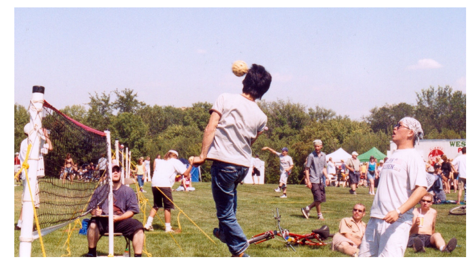
Top: Soccer girls turned Takraw players